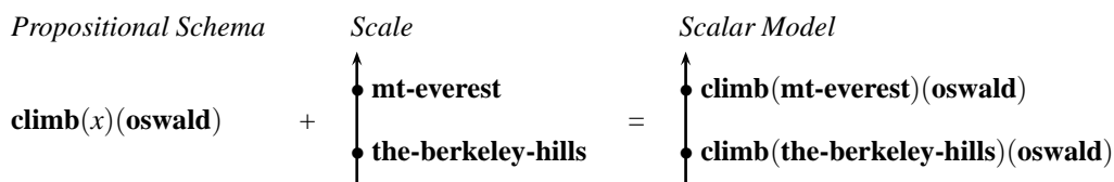
Figure 1: Scalar model for (10)

Figure 1 shows how, in a scalar model, the scale relating the correlate and remnant is mapped onto informativeness. The elements of the scale are fitted into a propositional schema, which is the full clause of (10) minus negation and with a variable in place of the Berkeley hills . Each member of the scale of mountains is slotted into this schema to produce a set of propositions ordered by a relation ‘more informative than’: climb(mt-everest)(oswald) is more informative than climb(the-berkeley-hills)(oswald) , since Mt. Everest is higher on the scale of mountains than the Berkeley hills.